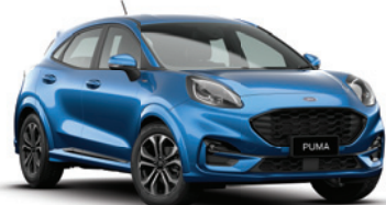
Desert Island Blue